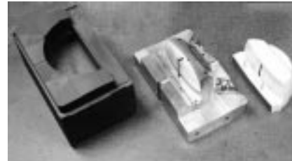
Electrode, mold, and product.

A plastic injection molding company serving the electronics and medical device industries had a problem making the mold for a component with a complicated contoured parting line. The double cavity mold involved four parting line burns, two for the cavity and two for the core. Each burn required four electrodes. The large electrode size required use of EDM 200 graphite to obtain 9" x 9" x 14" blocks. Using carbide ball endmills at 40 in/min required a 13-hour tool path. Cutters wore out before the end of one cut, necessitating three tool passes with a new cutter for each pass for a total machining time of 39 hours. The required accuracy of \pm 0.001 " was never achieved.