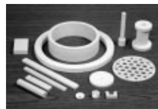
Typical finished ceramic parts.

A central vacuum system captures the dust produced by endmilling and other machining operations.