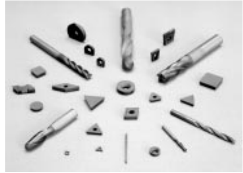
sp^3 's offering of diamond tools encompasses over 500 styles of endmills, drills, insertable cutters, routers, saws, and other tools.

Insert shapes available include diamond ( 35^\circ , 55^\circ and 80^\circ ), triangle, square and round. All inserts are ANSI standard sizes and tolerances. Sizes (inscribed circle) range from 1/4 " to 1 1/4 ". Styles include screw-down, pin-held and clamp.